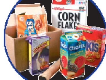
Cajas de cartón