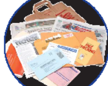
Papel y periódico