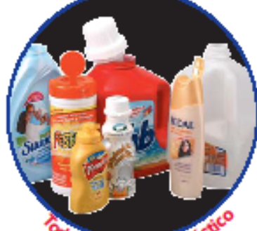
Todos envases de plástico