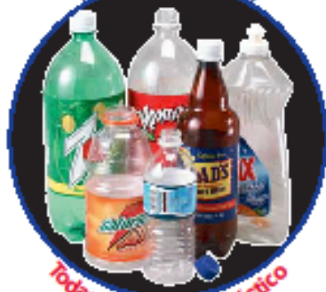
Todas botellas de plástico