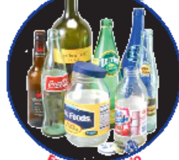
Envases de vidrio