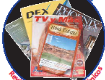
Revistas y directorios telefónicos