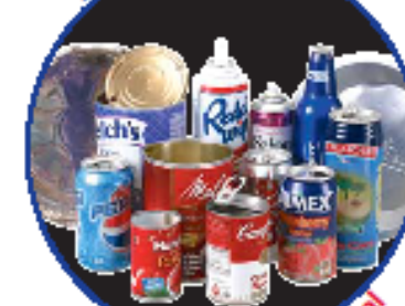
Latas de aluminio o metal